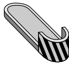
Raised safety zone

A raised area, or an area indicated by traffic signs and pavement markings, in the middle of the road for the purpose of ensuring the safety of passengers boarding or disembarking from streetcars, or pedestrians crossing the street.